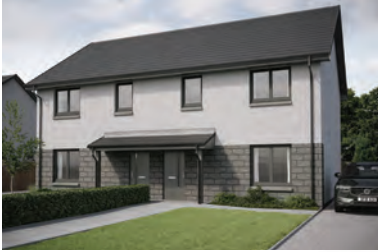
C4 - CULLERLIE WITH CANOPY

All images and floorplans are for illustrative purposes only. Care has been taken to ensure the accuracy of information provided. Dimensions given are correct at time of print but should not be used for ordering flooring or furnishing items. External finishes may vary – please check with your Sales Advisor for individual plot details. Images, photographs