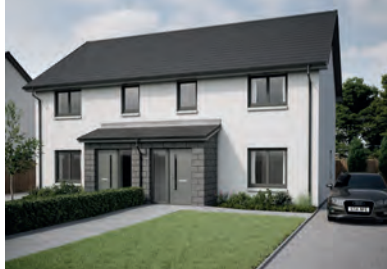
C - CULLERLIE WITH PORCH

All images and floorplans are for illustrative purposes only. Care has been taken to ensure the accuracy of information provided. Dimensions given are correct at time of print but should not be used for ordering flooring or furnishing items. External finishes may vary - please check with your Sales Advisor for individual plot details. Images, photographs and dimensions do not form any part of contract or warranty.